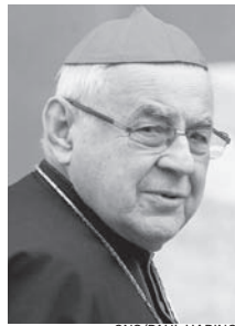
Czech Cardinal Miloslav Vlk

Born in Lisnice, Czechoslovakia, he studied history at Prague's Charles University, earned a doctorate in philosophy from the University of Prague and